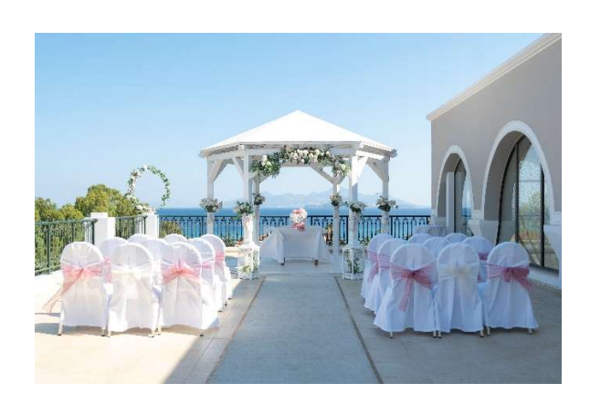
LOCATION 1 Panoramic Terrace (Max 100 pax)